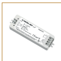
Sterownik do taśm jednokolorowych Single colour LED strips controller