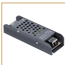
Zasilacz modułowy 100W Modular power supply 100W