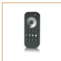
Pilot do taśm jednokolorowych Remote for single colour LEDstrips