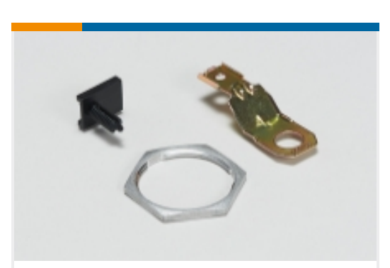
Other Automotive Connector Accessories(15)