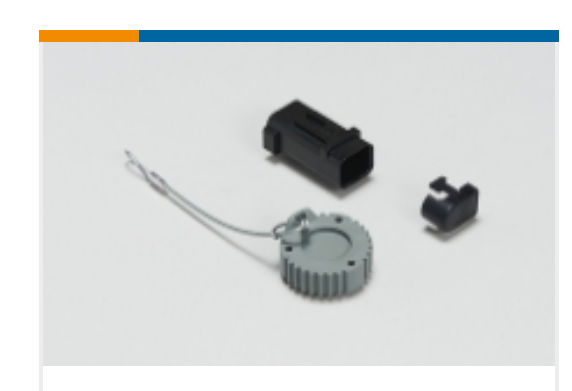
Automotive Connector Caps & Covers (16)