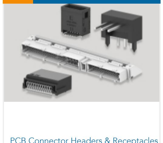
PCB Connector Headers & Receptacles (13)