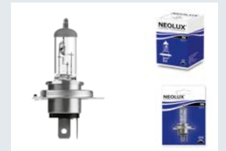
H4 | N472 | Standard