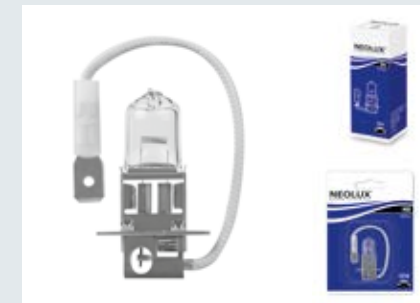
H3 | N453 | Standard