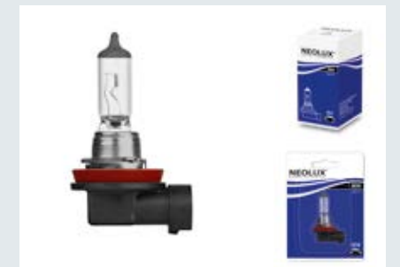
H11 | N711 | Standard