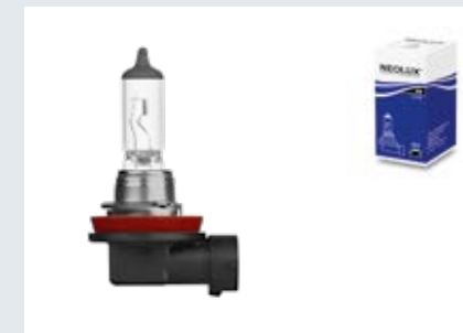
H8 | N708 | Standard