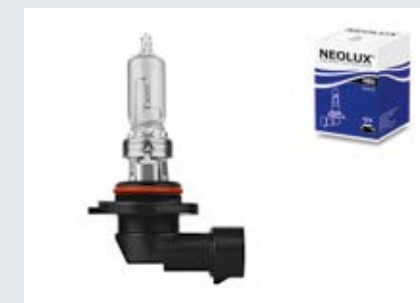
HB3 | N9005 | Standard