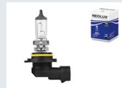
HB4 | N9006 | Standard