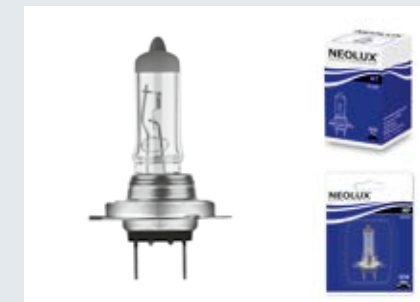
H7 | N499 | Standard