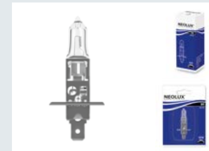
H1 | N448 | Standard