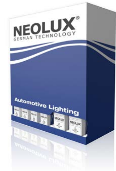
Counter display 24V