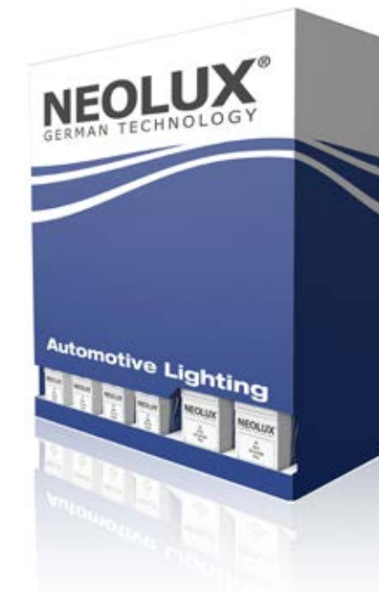
Counter display 12V

Please contact us at: contact-en@neolux-lighting.com